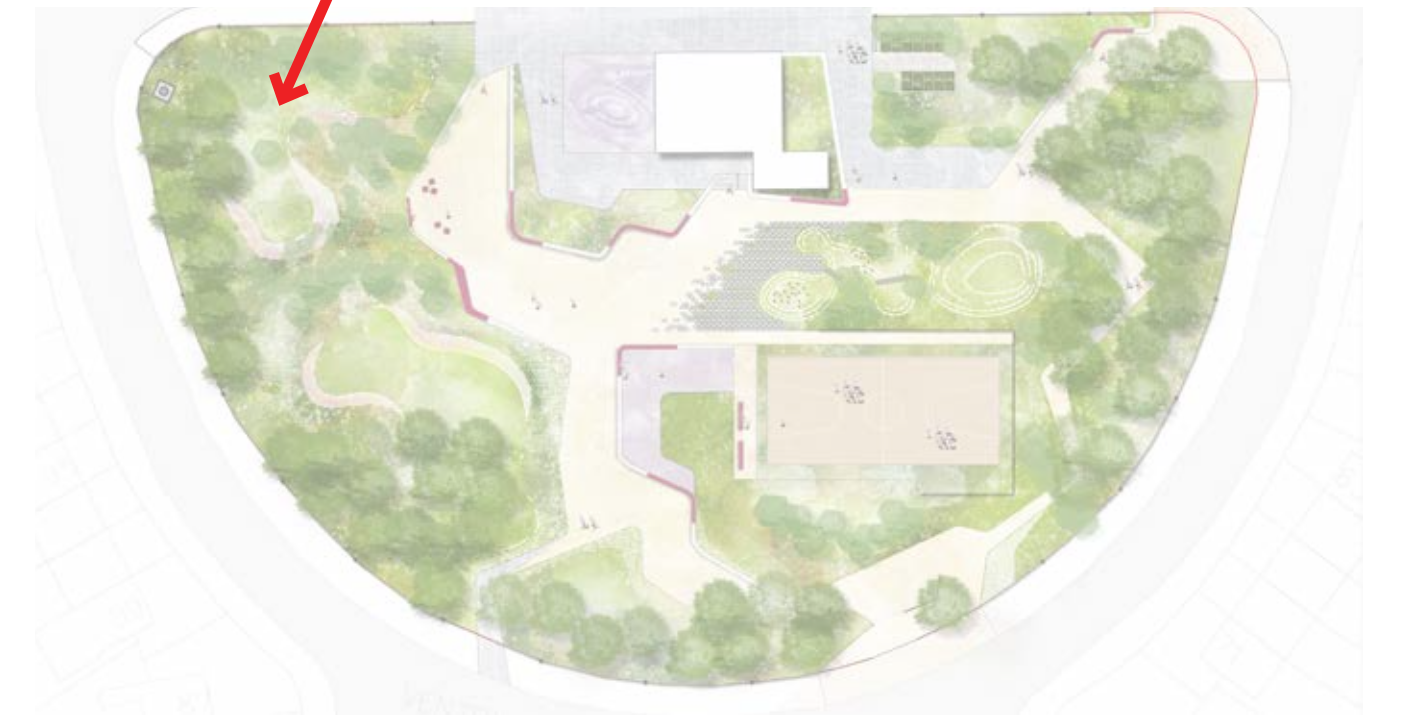
VIEW TOWARDS INFORMAL AMENITY AREA

VIEW OF THE INFORMAL AMENITY AREA WITH WILDFLOWER PLANTING