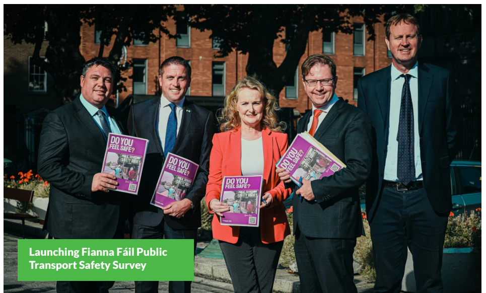
Launching Fianna Fáil Public Transport Safety Survey