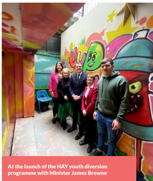
At the launch of the HAY youth diversion programme with Minister James Browne

Mol an oige agus tiocfaidh siad, support young people and they will flourish