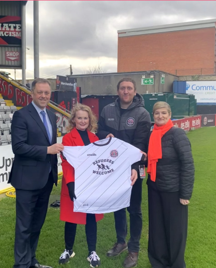
Visiting Dalymount Park with Minister Thomas Byrne and Councillor Eimer McCormack