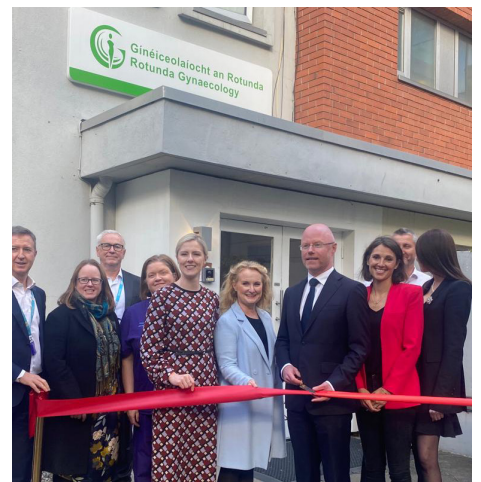
Opening the new Menopause Clinic with Minister for Health Stephen Donnelly and Senator Lisa Chambers

Campaign to name the National Children's Hospital after Dr Kathleen Lynn