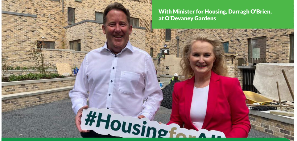
With Minister for Housing, Darragh O'Brien, at O'Devaney Gardens

Young girls in Corpus Christi NS and the local community need access to their school hall. Following my representations to the Minister for Education, Norma Foley TD, there have been positive developments to re-open Corpus Christi Hall in Drumcondra. Stakeholders are engaging to divest the hall to the trustees of Corpus Christi NS. I continue to work with the school, local community, Department of Education and others to reopen the hall at the earliest opportunity.