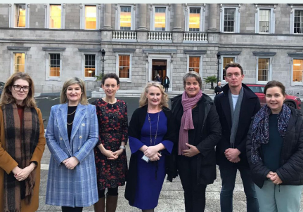
With the Save Our Hall Campaign in Leinster House

In 2015 as a City Councillor, I supported Dublin City Council's purchase of Dalymount Park. Under the last government progress was too slow but following my visit with Fianna Fáil Minister for Sport Thomas Byrne TD an application for planning permission should be made in May 2023