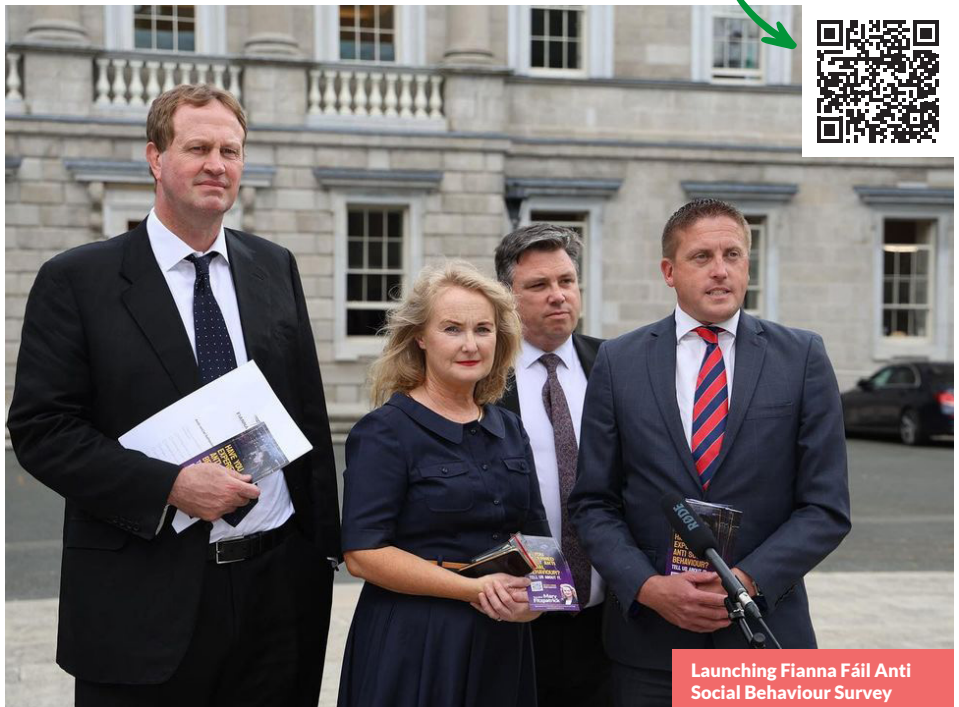
Launching Fianna Fáil Anti Social Behaviour Survey