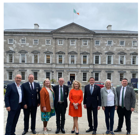
With the 1916 Relatives Association

My motion to name the new National Children's Hospital after Dr Kathleen Lynn secured unanimous support in Seanad Eireann and was accepted by government. The motion recognised Dr Kathleen Lynn's contribution to women's and children's healthcare and called on the government to name the new National Children's Hospital after Dr Kathleen Lynn. I was also delighted to secure the support of the Joint Oireachtas Committee for Health and the Oireachtas Women's Caucus for the campaign to name the new hospital after Dr Kathleen Lynn. Government now has a clear mandate to name the National Children's Hospital after Dr Lynn.