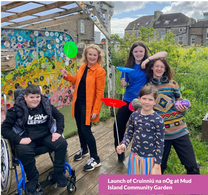
Launch of Cruinnú na nÓg at Mud Island Community Garden