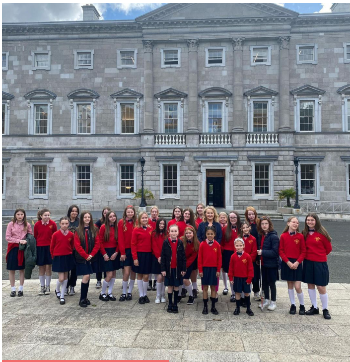
Christ the King Girls School visiting Leinster House