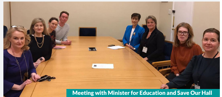
Meeting with Minister for Education and Save Our Hall

Well done to everyone who successfully supported the re-opening of The Corpus Christi Hall on Home Farm Road. I was delighted to work with all stakeholders to secure support from Minister for Education, Norma Foley and others. I welcome the divestment of the hall to Corpus Christi National School and the commitment that the hall will be used for school and community purposes. This is a great outcome for all.