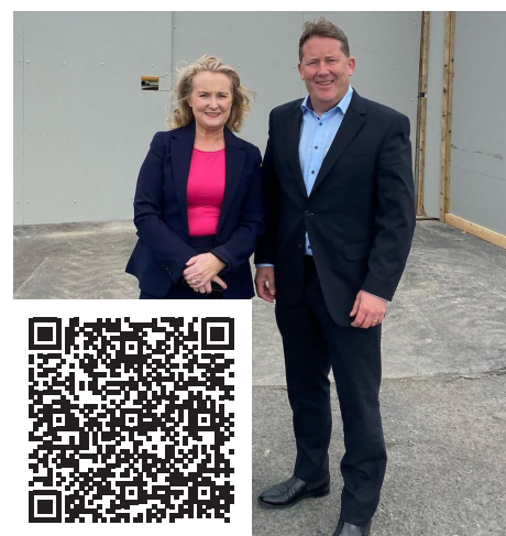
Link to map