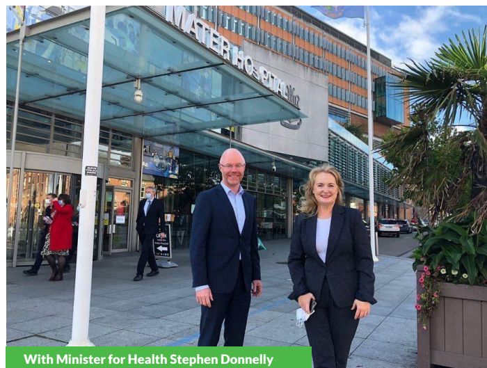
With Minister for Health Stephen Donnelly

This funding will develop a National Campus of Excellence for the Visually Impaired at Childvision on Gracepark Road along with a day services hub for adults with autism at Adelphi House. For young people and anybody suffering from an eating disorder, a dedicated eating disorder clinic will be located on Griffith Avenue. This new funding builds upon Fianna Fáils commitment to increasing and improving healthcare provision for all.