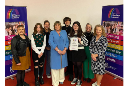
Congratulations to Cabra For Youth staff, volunteers and young people for winning Belong To Rainbow Award

A new special school has been announced for Dublin Central. The new school in Grangegorman will cater for students aged between 4-18 and will support students with autism and Moderate General Learning Disability with complex needs who have a professional recommendation for a special school. This special school will provide a nurturing and inclusive environment, ensuring that every child receives the support and attention they deserve.