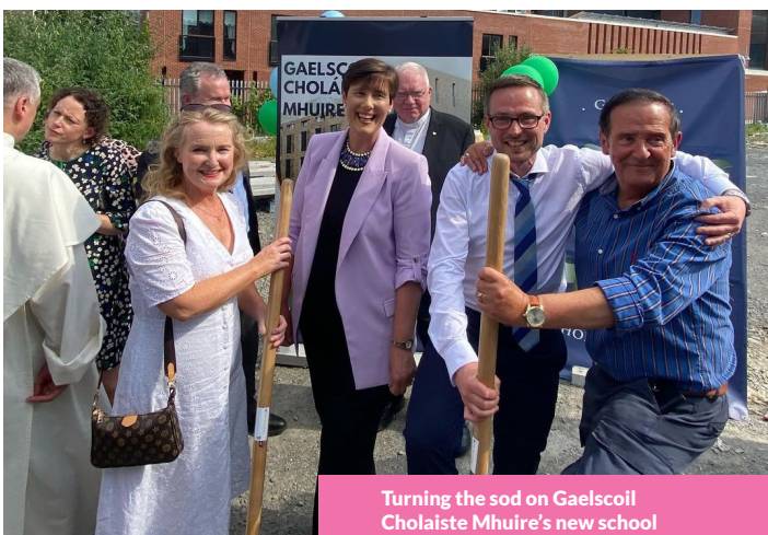
Turning the sod on Gaelscoil Cholaiste Mhuire's new school

After 20 years, the boys and girls of Gaelscoil Cholaiste Mhuire are finally set to get their new school. Building of the new 16 classroom school has commenced on Dominick Street. There will be resource rooms, a library, recreation spaces and a general-purpose hall. Construction is expected to take 24 months. The new school will enable the pupils of Gaelscoil Cholaiste Mhuire to grow, learn and reach their full potential.