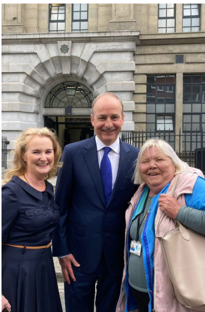
Reopening Fitzgibbon St Garda Station with Tánaiste Micheál Martin