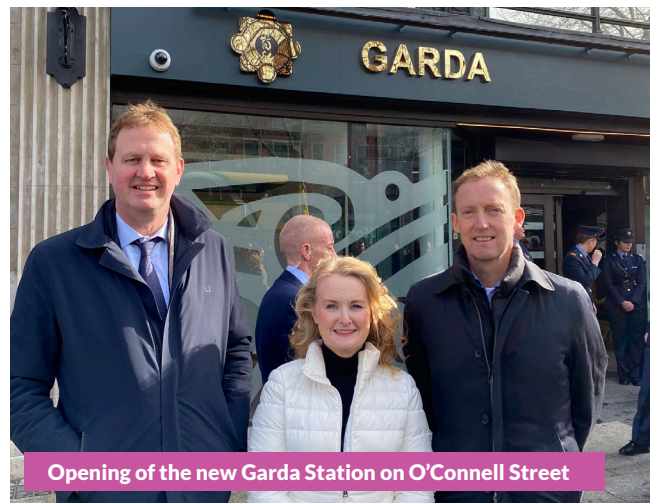
Opening of the new Garda Station on O'Connell Street