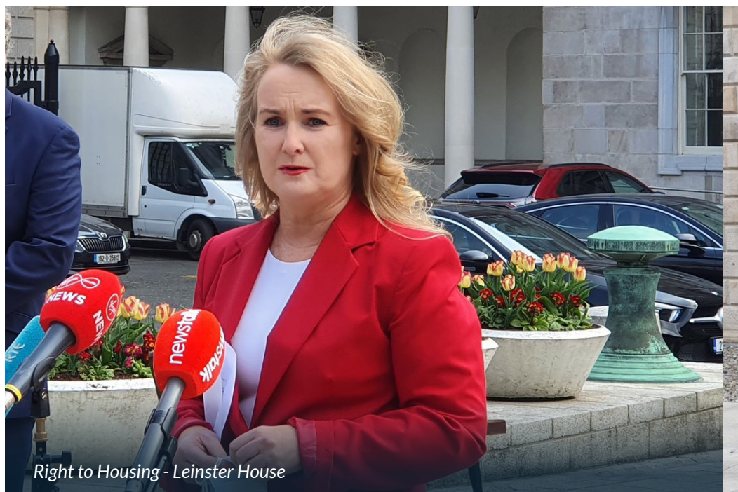
Right to Housing - Leinster House

The Commission aims to submit its proposal to Government by the end of the year.